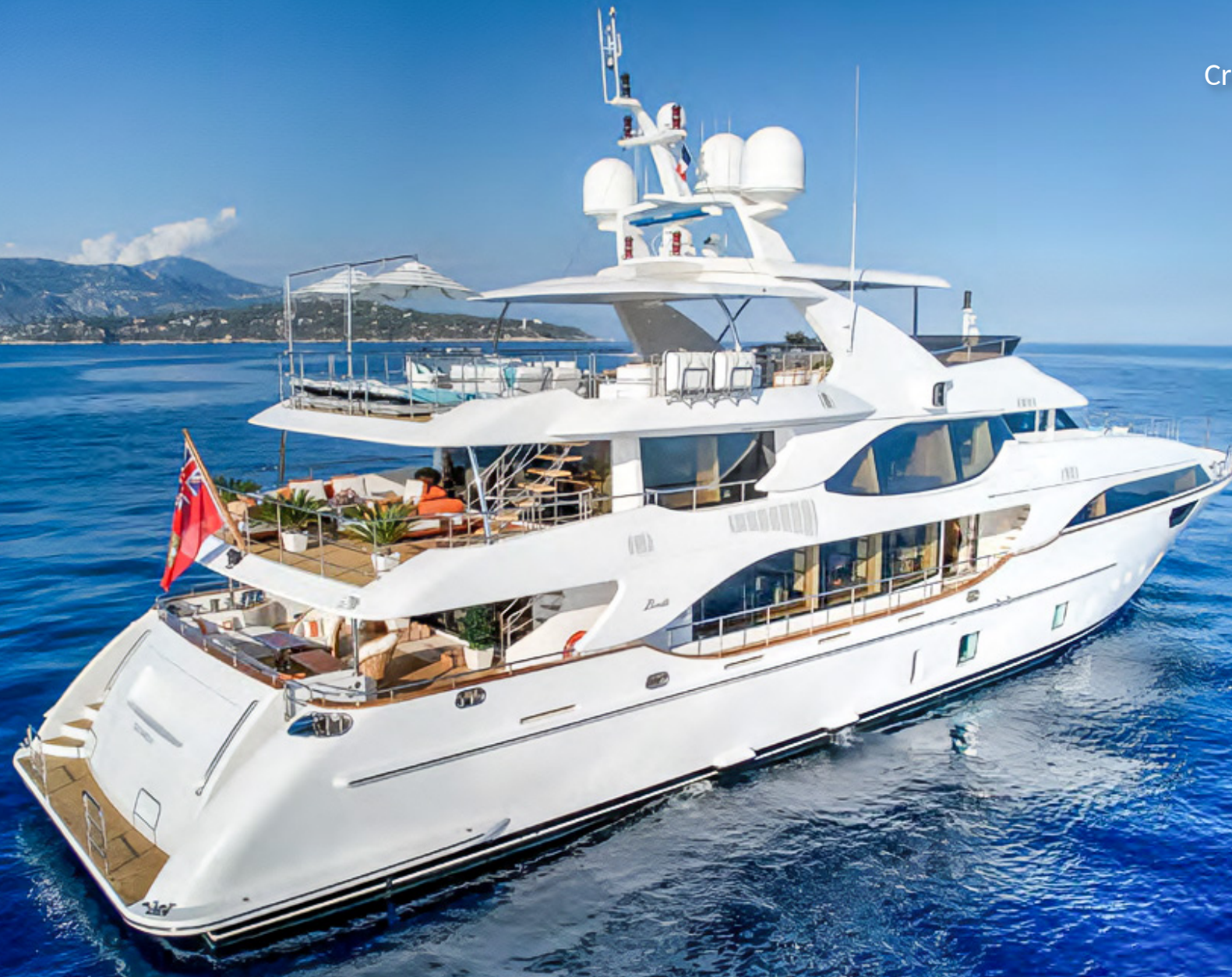
BENETTI CRYSTAL 140