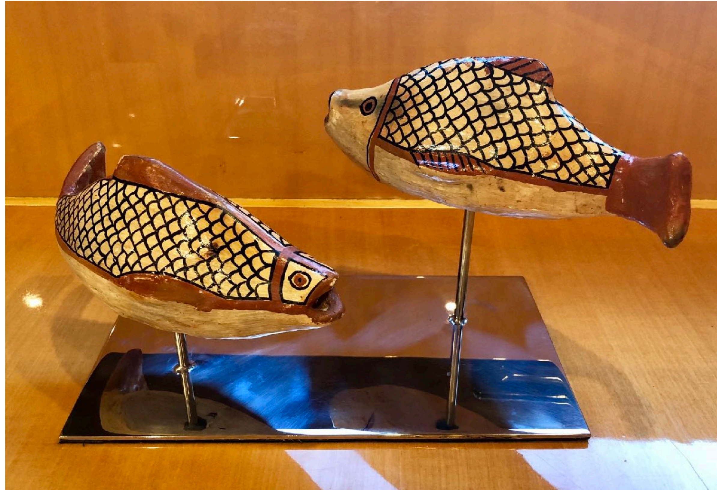
M/Y Villa sul Mare