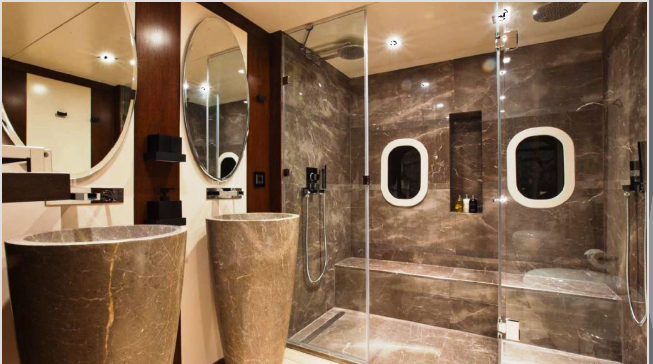
V.I.P CABIN BATHROOM