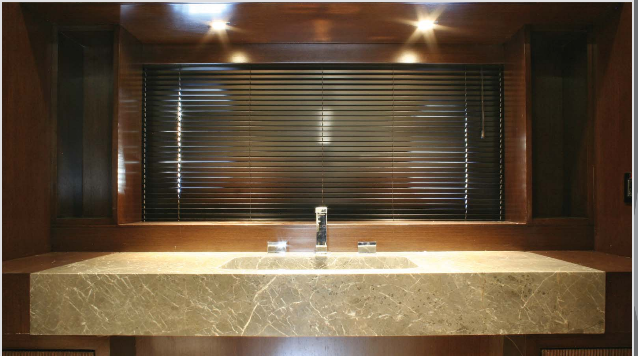
BATHROOM OF THE MASTER CABIN