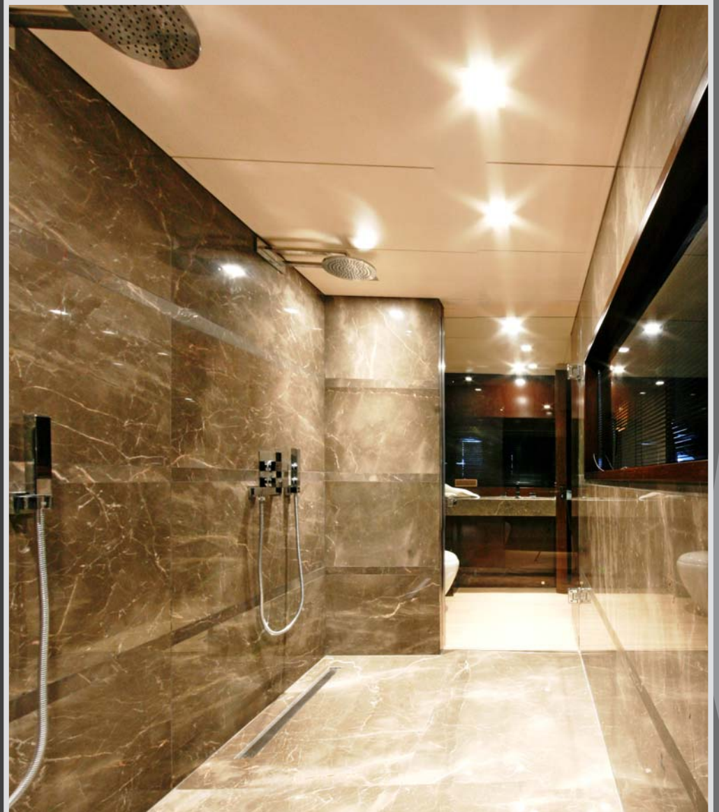
BATHROOM OF THE MASTER CABIN