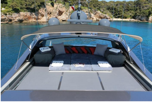
Upper deck lounge