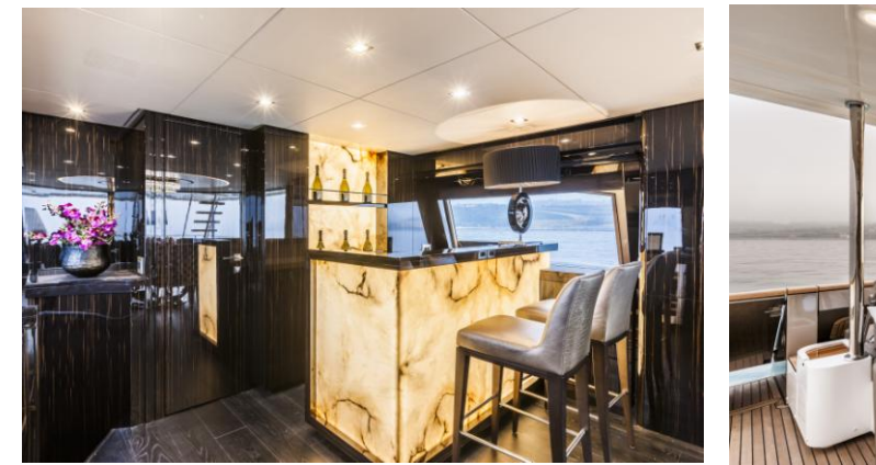
Upper deck bar