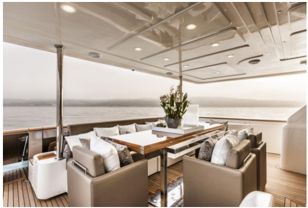
Al fresco dining main deck