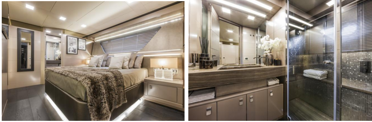
Double cabin 1