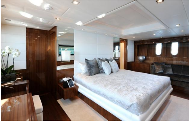
Master Cabin 1