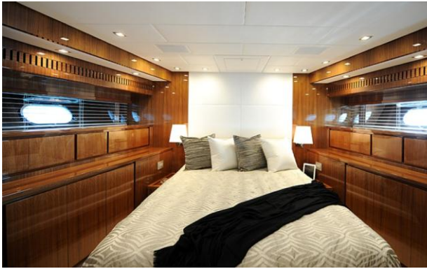
VIP Cabin Lower Deck