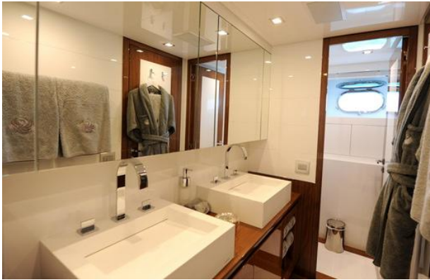
Master Bathroom 1