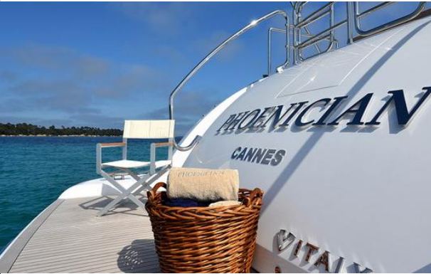
Garage & Swim Platform