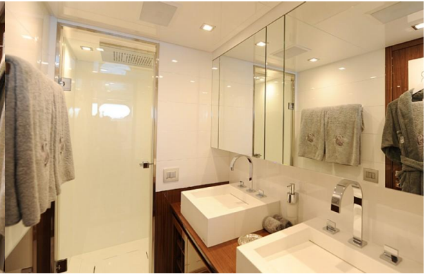
Master Bathroom 2