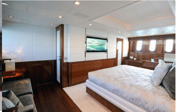
Master Cabin 2