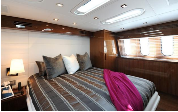
VIP Cabin Main Deck