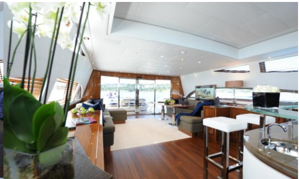
Main Saloon 2